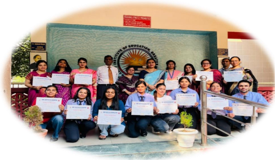
Principal, Registrar, faculty members & resource person along with students of B.Ed. Spl Ed. Batch (23-25 & 24-26) after certificate distribution ceremony